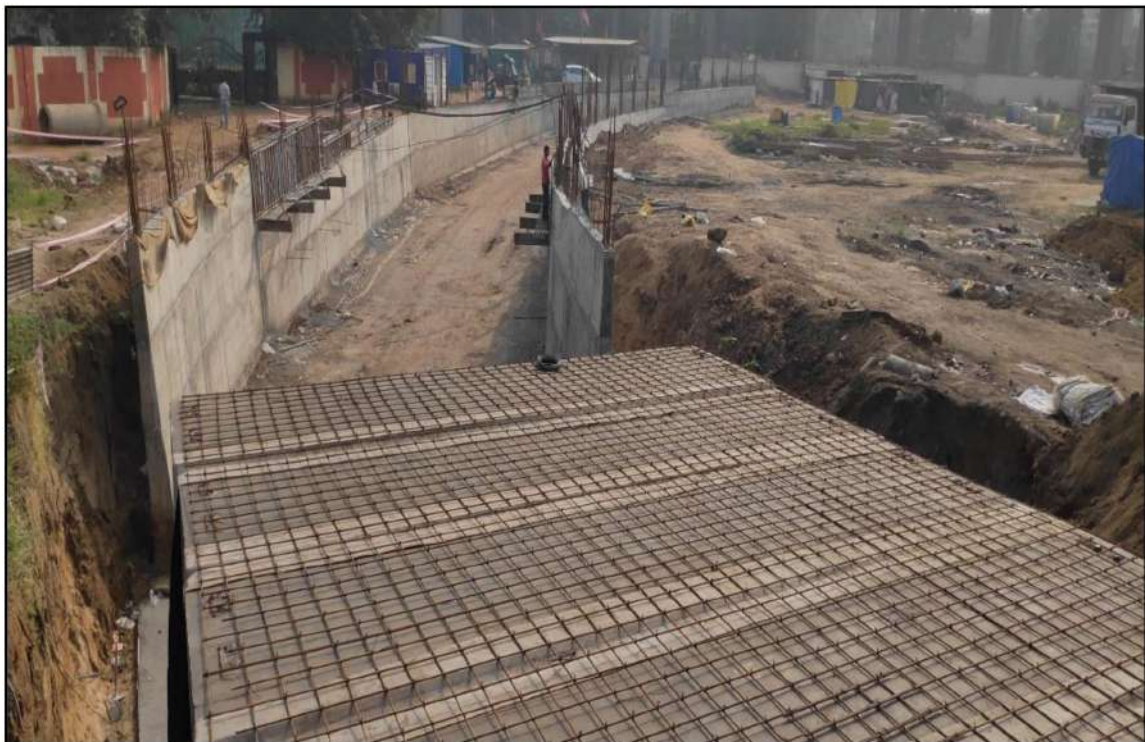
Road Under Bridge 1 - under construction - Approach towards Chimanbhai bridge side, Ahmedabad, Gujarat