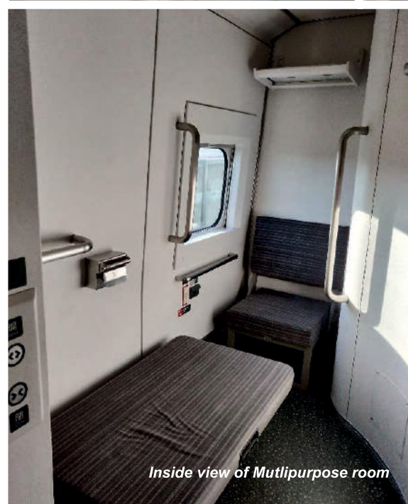
Inside view of Mutlipurpose room