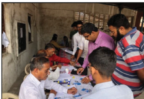
Consent Camp for Land acquisition at Niyol village, Surat, Gujarat

During the year, R&R Awards have been declared for total 667 plots [i.e. 569 plots in the State of Gujarat and 98 plots in the Union Territory of DD & DNH].