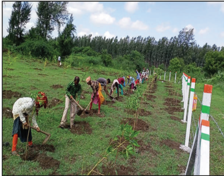
Employment opportunities for Kudasad villagers, Surat, Gujarat