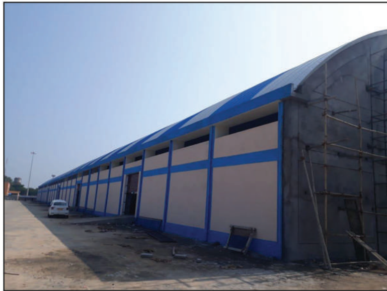
External Finishing Works in progress at CONCOR Khodiyar Warehouse 2, Sabarmati, Gujarat

During the year, pilot version for Green High Speed Rail (HSR) rating has also been developed by Indian Green Building Council (IGBC) for the first time for any HSR project in India.