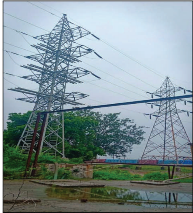
Tower erection and Stringing work by Torrent Power Limited at Vatva, Ahmedabad, Gujarat