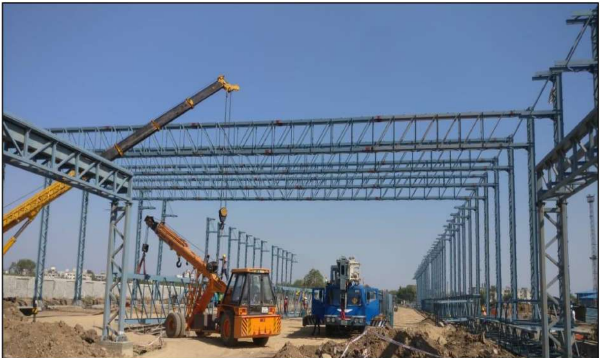
Gantry 1 – Beam under erection at Flash Butt Welding Workshop, Ahmedabad, Gujarat

The progress / status of Shifting of existing Railway facilities and Utilities during the year are as follows: