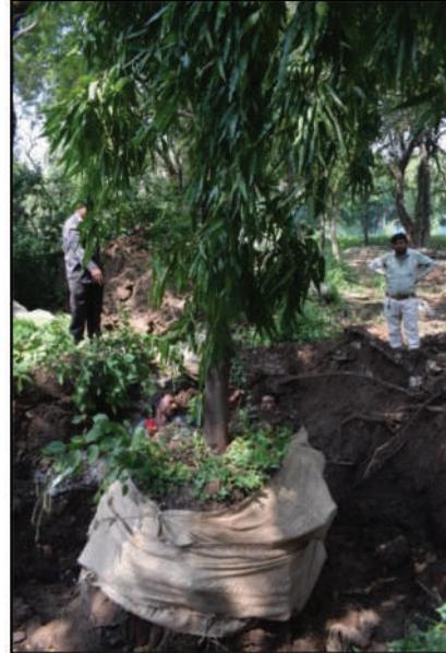
Tree Transplantation, Vadodara, Gujarat