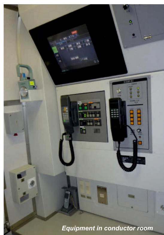
Equipment in conductor room