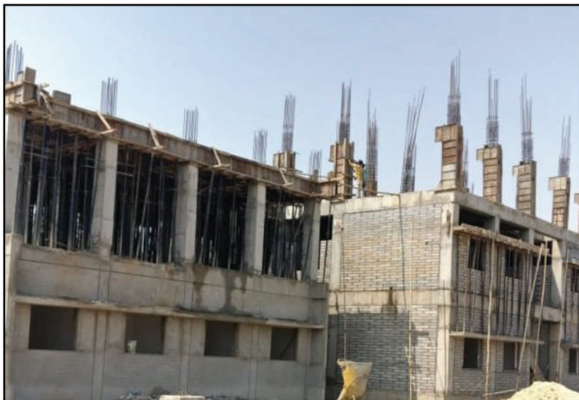
Slab & Column, Reinforcement and RCC work in progress at Administration Building of Bridge Workshop, Ahmedabad, Gujarat