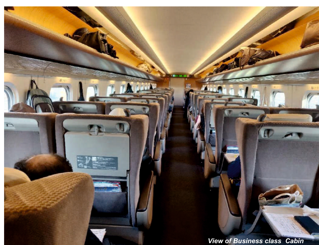
View of Business class Cabin