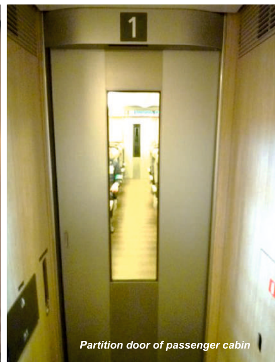
Partition door of passenger cabin