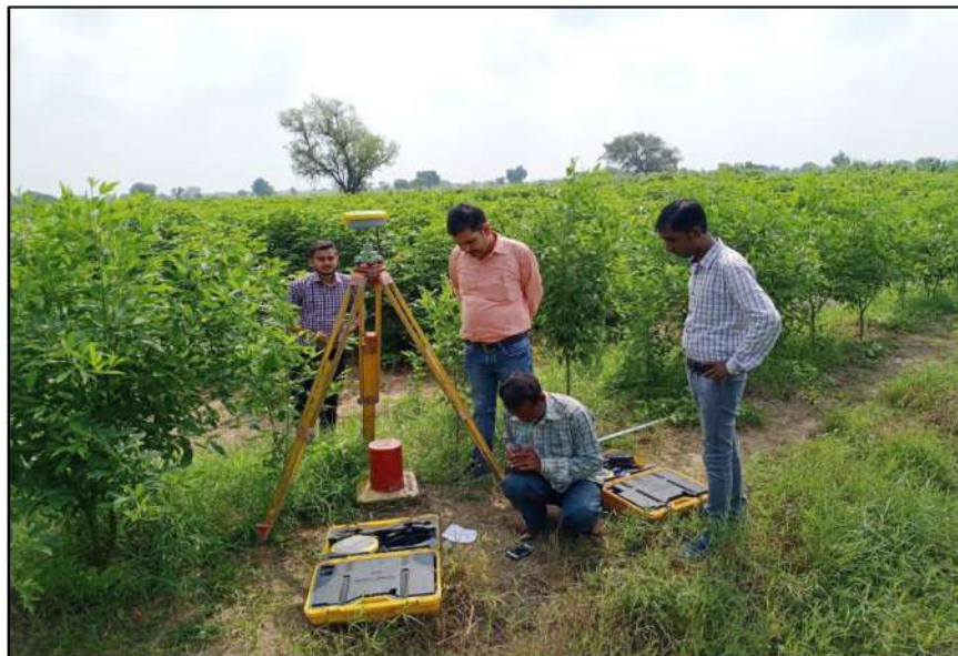
Right of Way Marking and Pillar Fixing at Kothi Vantarsha Village, Bharuch District, Gujarat