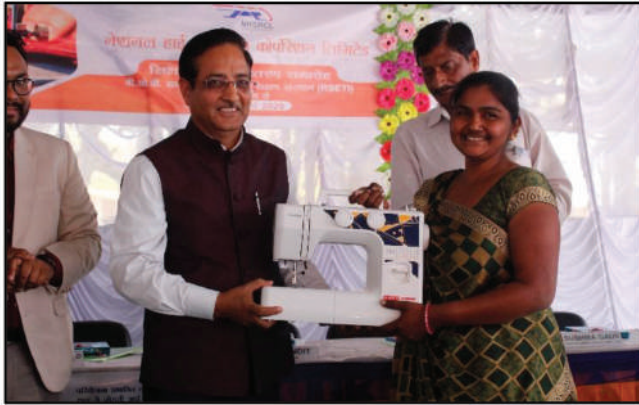
Sewing machine distribution to participants of Income Restoration Plan training, Ahmedabad, Gujarat.

To enable women to augment their skill set for income generation, your Company has organized, in February – March 2020, a month long Stitching and Tailoring course for women of Chenpur and Ropda villages in Ahmedabad in association with Rural Self Employment Training Institutes (RSETI). The course was attended by 23 women (i.e. 9 women from Chenpur and 14 women from Ropra), who were given sewing machines upon completion of the course.