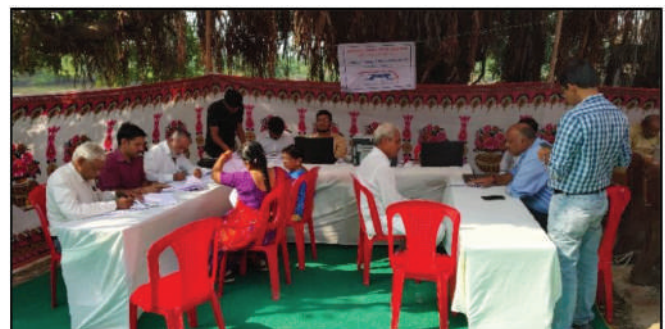
Consent camp for Land acquisition, Bharuch, Gujarat