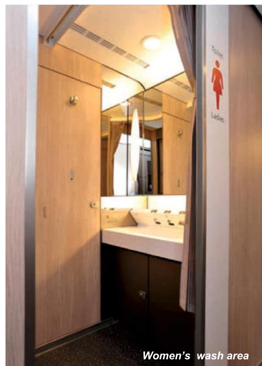
Women's wash area