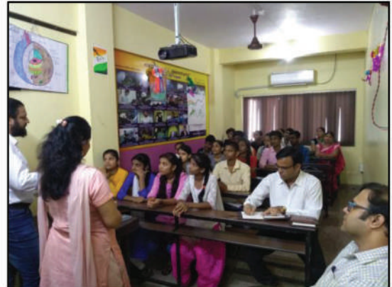
Training courses Under Income Restoration Plan at Vasai Taluka, Palghar, Maharashtra

45 days entrepreneurship program titled ‘Computer Hardware and Networking program’ was conducted, in June – July 2019, by your Company in association with RUDSET (Rural Development and Self Employment Training Institute) at Vadodara, Gujarat, which was attended by 28 candidates. The focus of training was on providing IT skills along with knowledge on setting up own business venture.