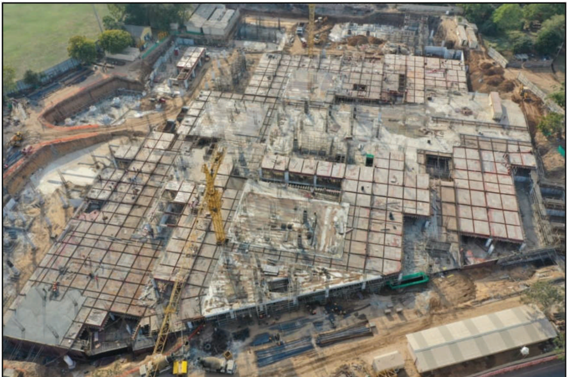
Construction of Ground Floor Slab in progress at Passenger Terminal Hub, Sabarmati, Gujarat

Draft specifications with respect to Track works have been prepared and are under finalization.