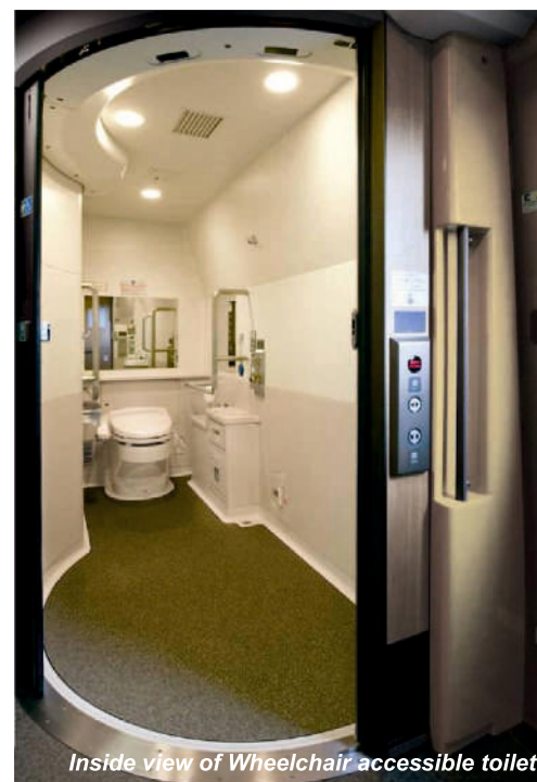
Inside view of Wheelchair accessible toilet