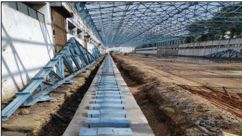
Goliath Foundation Works at Bridge Workshop, Sabarmati, Gujarat

The Board has adopted policies and procedures for ensuring orderly and efficient conduct of its business, including adherence to the Company's policies, safeguarding its assets, prevention and detection of frauds and errors, accuracy and completeness of the accounting records, and the timely preparation of reliable financial disclosures. The Company's internal control system is commensurate with its size, scale, and complexities of its operations.