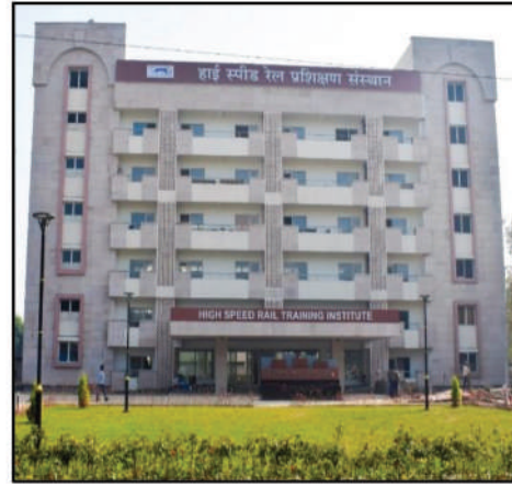
From drawing board to ground reality – HSR Training Institute, Vadodara, Gujarat