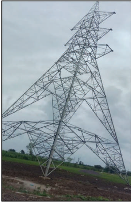
Tower erection of 220 kV line (i.e. Vapi / Kharadpade & Vapi / Mangalwada Crossing chainage 169.334), Vapi, Gujarat